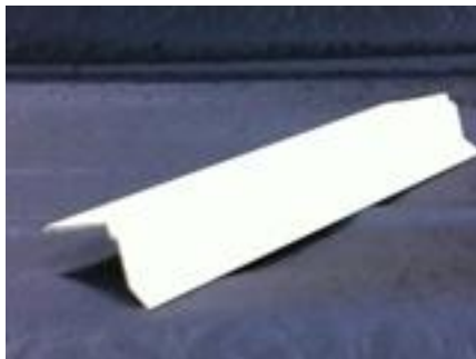
Sheet End Trim